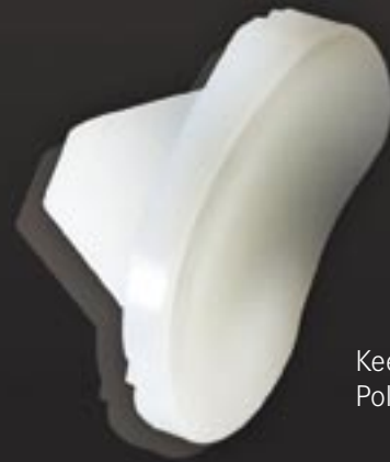
Keeled Poly Glenoid