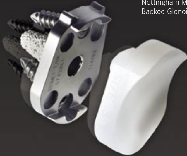
Nottingham Metal Backed Glenoid